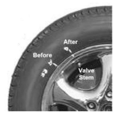
3" Slip After Mild Driving